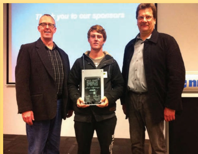
Roof tiling apprentice award winners from NMIT and Holmesglen TAFEs