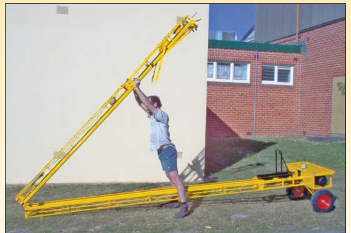
'Folding standard shape Cable Hoist'