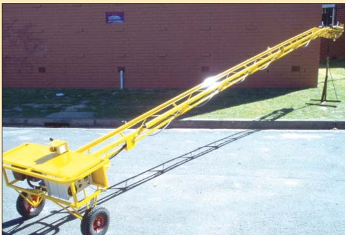
'V' shape Rapid Return Cable Hoist'

Get your New Year off to a speedy start with a Rapid Return!